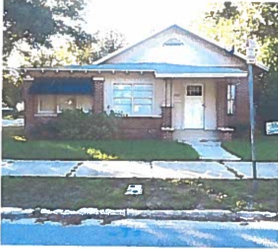
3899 Herschel Street